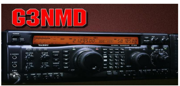
G3NMD Newsletter Houghton-le-Spring ARC

Welcome to the Houghton-le-Spring ARC newsletter for April 2018,